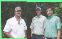
Agri Services International featured in the Sept. In The Field Magazine