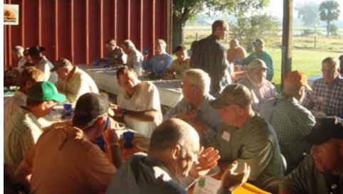
Growers enjoy breakfast during the 2010 Wauchula Estimate Breakfast.

Realtors will sponsor breakfast at the Davis' Barn, CR 636 East, Wauchula. The Green Acres 4-H Club will cater.