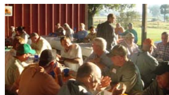
2010 Hardee Estimate Breakfast