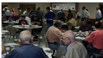
2010 DeSoto Estimate Breakfast

Guesstimate prizes will be provided by Yara North America and Keyplex.